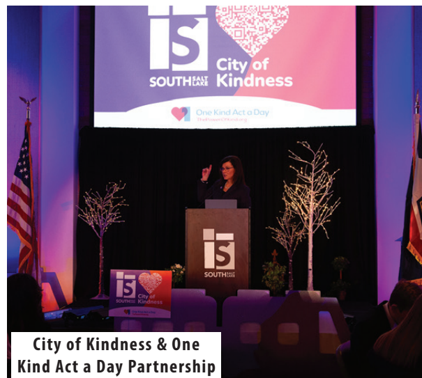
City of Kindness & One Kind Act a Day Partnership