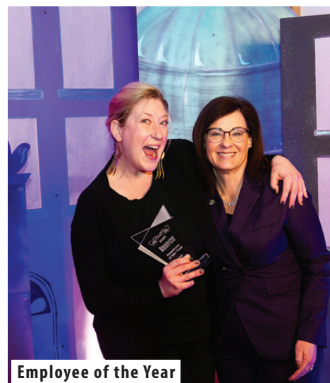
Employee of the Year