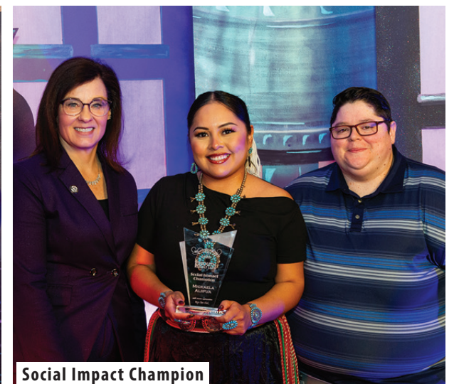
Social Impact Champion