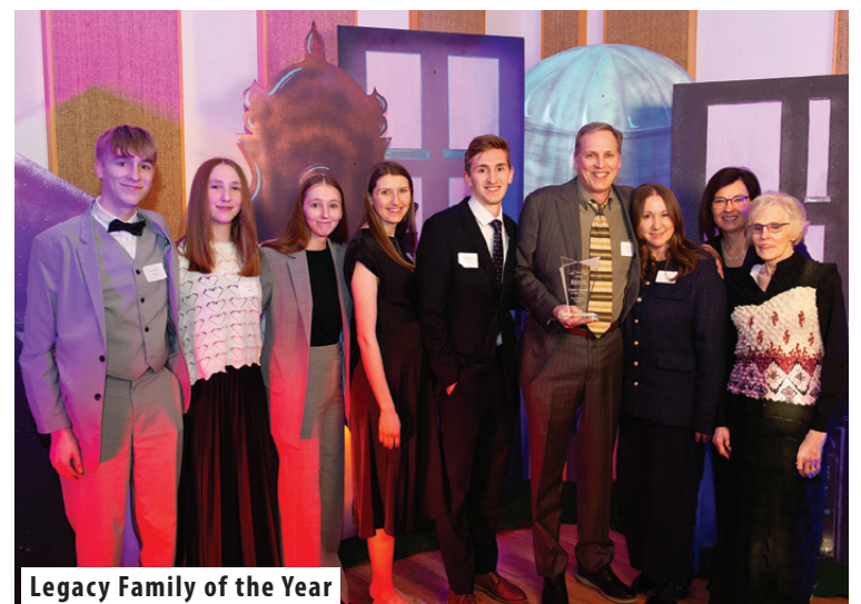
Legacy Family of the Year