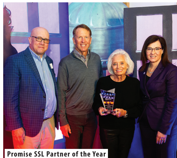
Promise SSL Partner of the Year