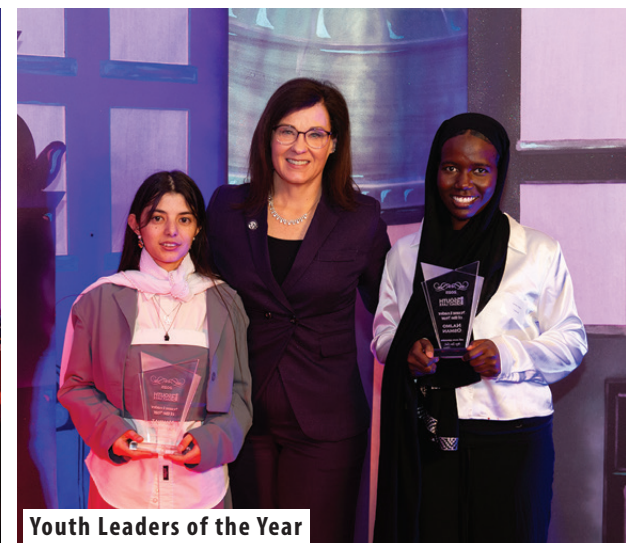
Youth Leaders of the Year