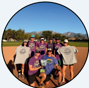
SSL Recreation Summer Softball Champions