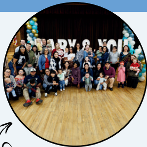
Promise SSL Baby & You Graduation

Big Ideas: How SSL Staff Are Inspiring Change Beyond our City Boundaries