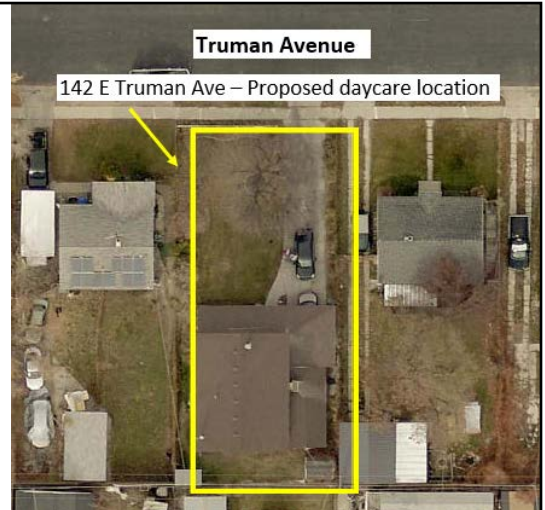
Figure 1. Aerial of Proposed Business Location